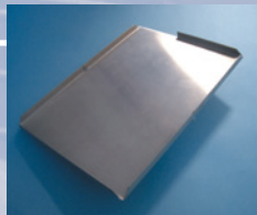
TB9772-Barrier Tray (fitted with drive pins)