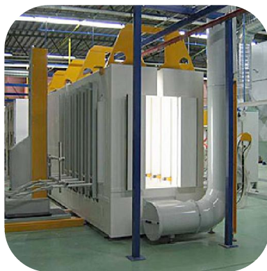
Continuous Paint Spray Booth