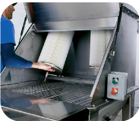
Powder Cartridge Booth System